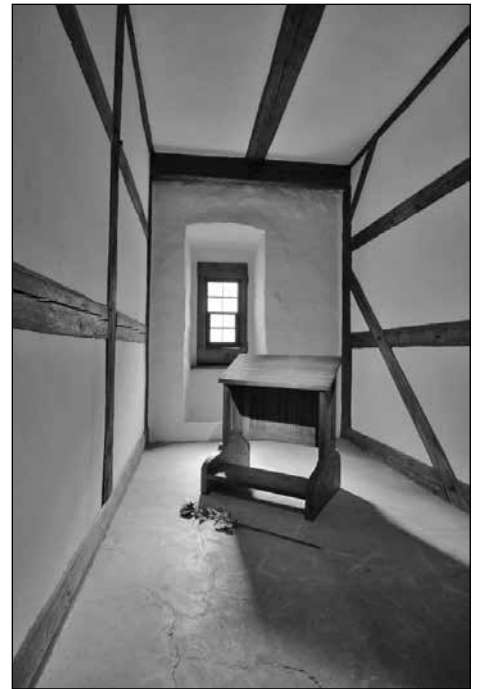
Martin Luther's cell at Erfurt monastery, which still exists, although it was damaged in an air raid in World War II. The cell Luther occupied is open to the public, and his personal Bibles—complete with his handwritten notes in the margins—are on display. See more pictures and information at: http://www.hcplive.com/physicians-money-digest/your-life/martin-luther-ii#sthash.JtpcnqQ.dpuf .