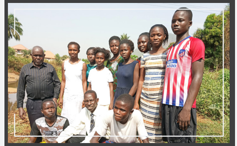
Young people interested in Guinea