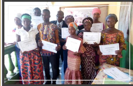
Biblical formation in Guinea