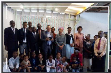
Members of the Church in Kinshasa