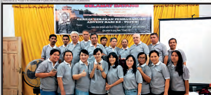
Group of members in Indonesia