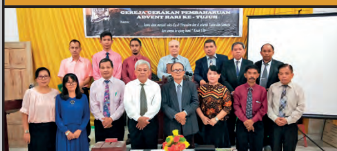
Field Officers in Indonesia

"Beware lest any man spoil you through philosophy and vain deceit, after the tradition of men, after the rudiments of the world, and not after Christ. For in Him dwelleth all the fulness of the Godhead bodily. And ye are complete in Him, which is the head of all principality and power." Colossians 2:8-10.