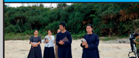
Preparations for baptism