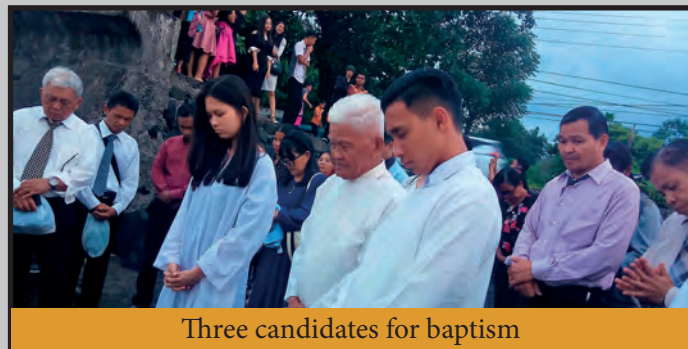
Three candidates for baptism