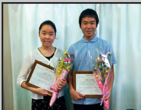
Two new members of the church