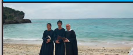
Candidates for baptism