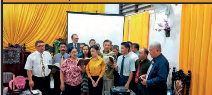
Choir in Indonesia