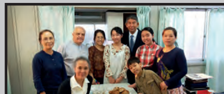
Sharing food with brothers in Japan