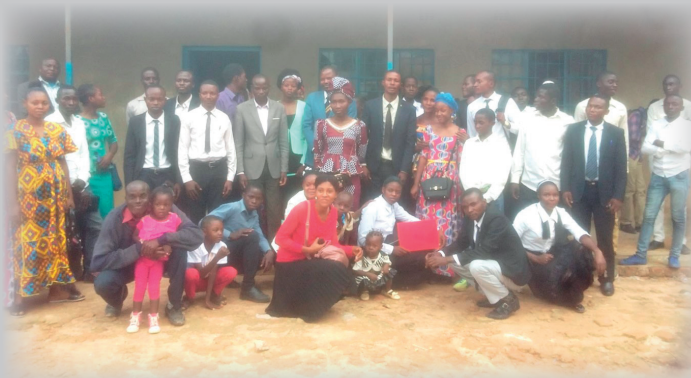
Youth Conference in Lubumbashi, 23-24 December 2017 65 participant attended the conference for two days, and different topics were developed (Joseph and his brothers, Heli and his sons, rebellion of Absolom, Daniel and his fellow brothers).