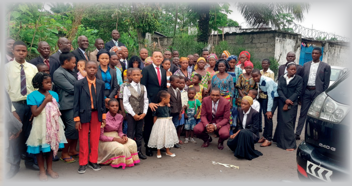
3 Churches ( Masina, Ngiringiri and Mikondo) composing the Kinshasa District, congreted together; the last Sabbath of 2017, it was a very inspiring Sabbath Fellowship.