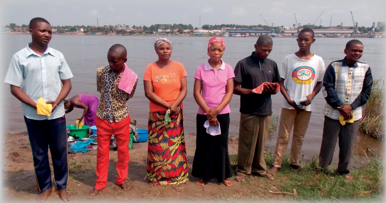
On the baptismal waters – 7 Souls, ready for baptism ceremony - to Join IMS , in Kisangani, North East Field - DR Congo