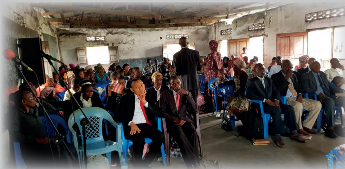
During Sabbath School Program.