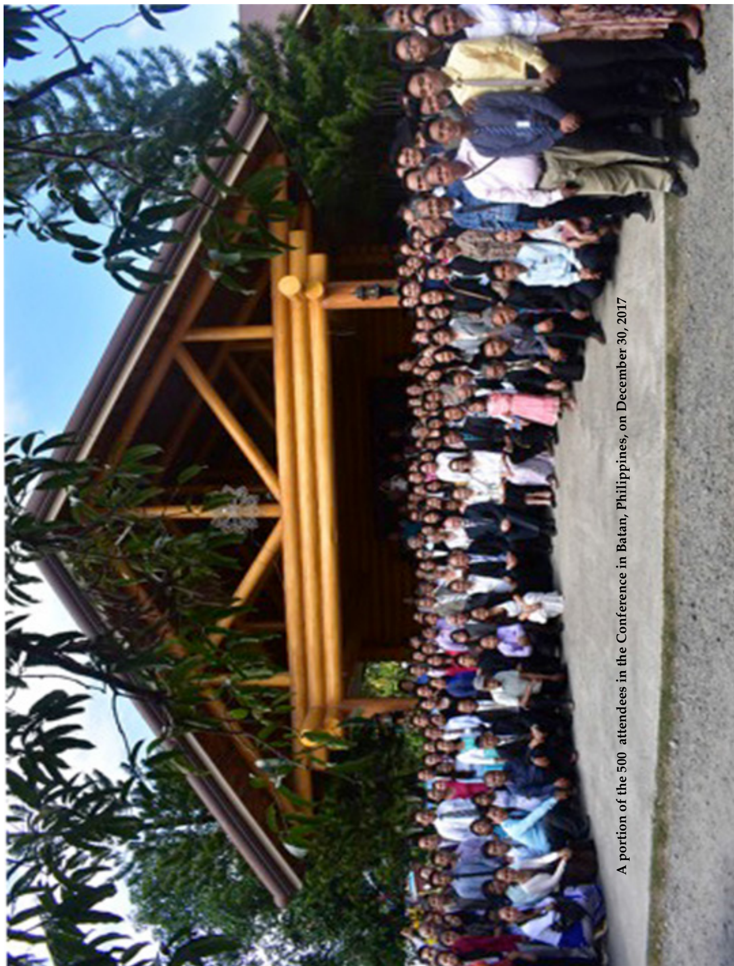
A portion of the 500 attendees in the Conference in Batan, Philippines, on December 30, 2017