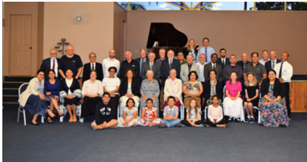
Oceania Union Conference