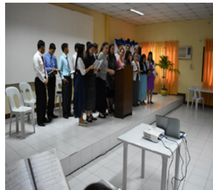
Special music was presented by a group from the Luzon Field.

The conference in the Philippines was greatly blessed by the very spiritual services. Everyone is waiting for the soon coming of our great Lord and Saviour Jesus Christ. May God continue to bless His work around the world along with the believers in the Philippine Union.