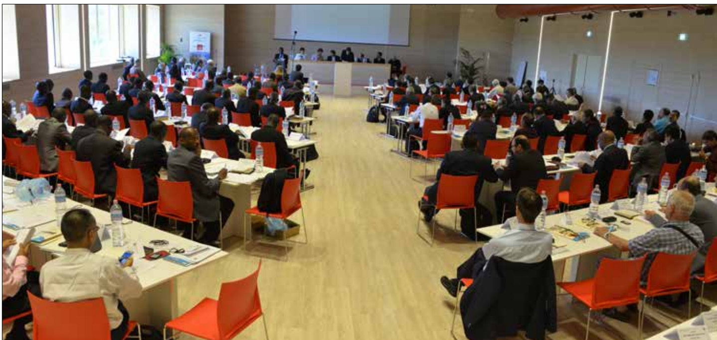
Salinello Conference Center Meeting Hall, location of the delegates' meetings as well as some Wednesday and Thursday Public Conference meetings.

A new feature in the delegates' meetings was electronic voting. This made a big difference in the amount of time that had to be spent on the mechanical operations, thus allowing additional time for the more important aspects of the meetings. There was also an electronic translation system with earphones.