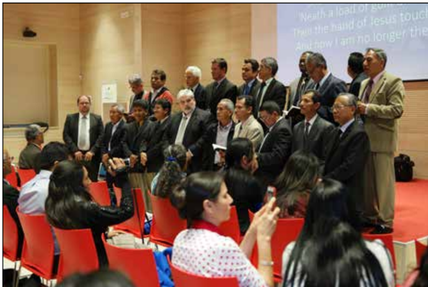
The choir of Spanish-singing delegates.

There is no everlasting life without God's grace. Jesus' life, death, and resurrection showed that through faith in Him all can be saved.