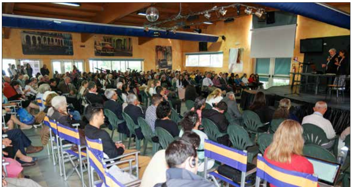
The Palazzetto hall was the second location when simultaneous presentations were held.

The Lord is calling us to surrender our lives to Him and to preach the gospel so it will be a witness throughout the world.