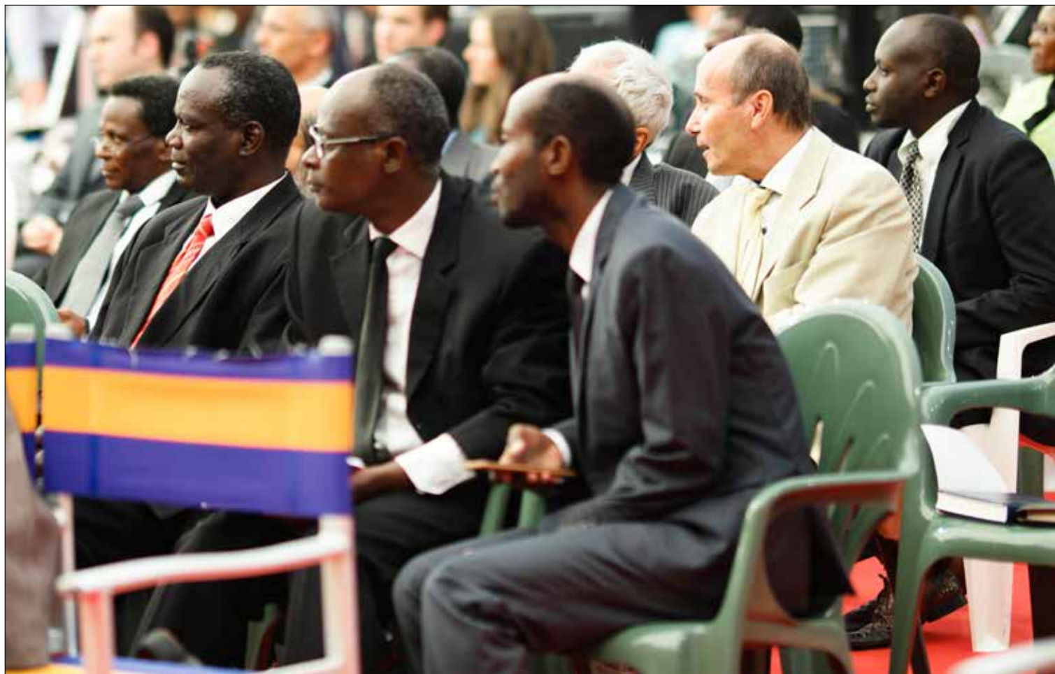
Attentive brethren from Africa and Europe (above) as well as many different countries rejoiced to experience the blessings of the Public Conference.