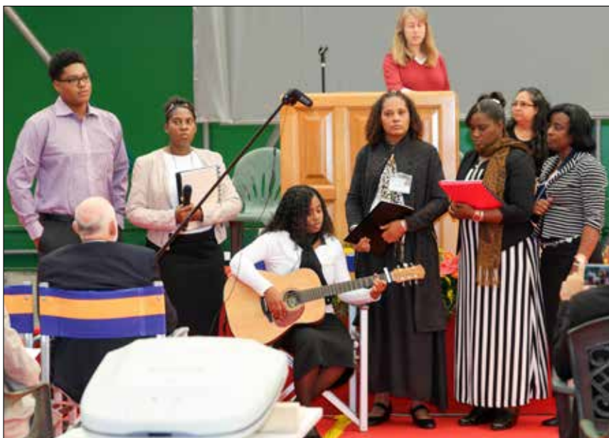
The Curacao musical ensemble sang dynamic music for the Sabbath school.