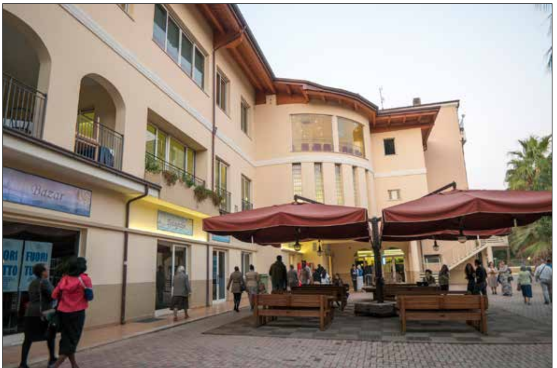
Salinello Camping Village Conference Center (Meeting Hall on the third floor, and Dining Room on the second floor).

He believed that the Bible was simple enough for all to read and determine His will.