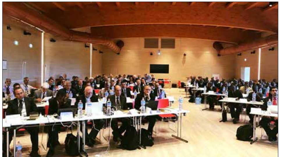
Delegates and officers in session.

The church is a family—the joining of heaven and earth—and what each person does or does not do affects the entire family. "If fathers and mothers are true Christians in the family, they will be useful members of the church, and will be able to conduct affairs in the church and in society after the same manner in which they conduct their family concerns. Parents, let not your religion be simply a profession, but let it become a reality." — Signs of the Times , May 8, 1894.