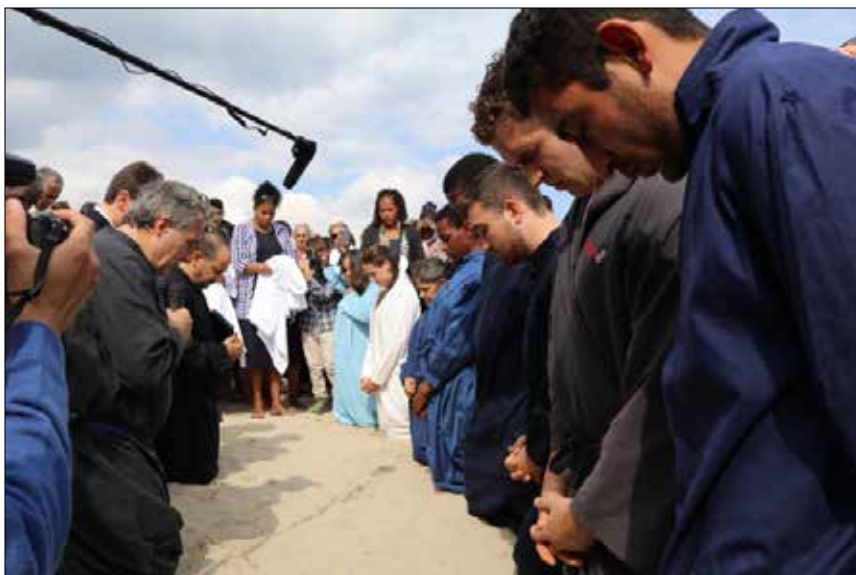
On Friday, eight souls were baptized in the sea.

sole source of truth. The Reformers were ready to enter the tomb and be resurrected at the last day; they were moved by the hope of seeing their loving Lord. They were attacked and persecuted in many different ways, but they clung to the pillars that stand as firm as the eternal hills.