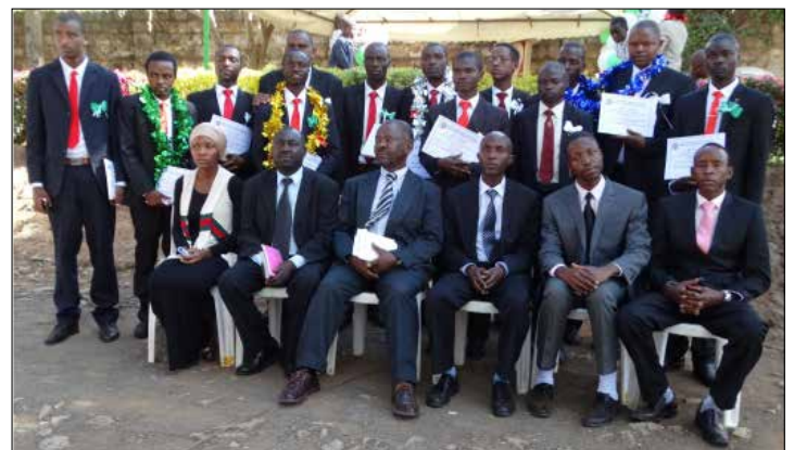
Instructors, staff, and students at the BAMI graduation, October 22, 2017.

Everyone who loves God and the heavenly kingdom will find some way to carry out His mission—by personal effort, by preaching, by contributing to the training and support of missionaries, by prayer, and by holding up the hands of those who bear heavy responsibilities in the name of God. May He bless every sincere effort!