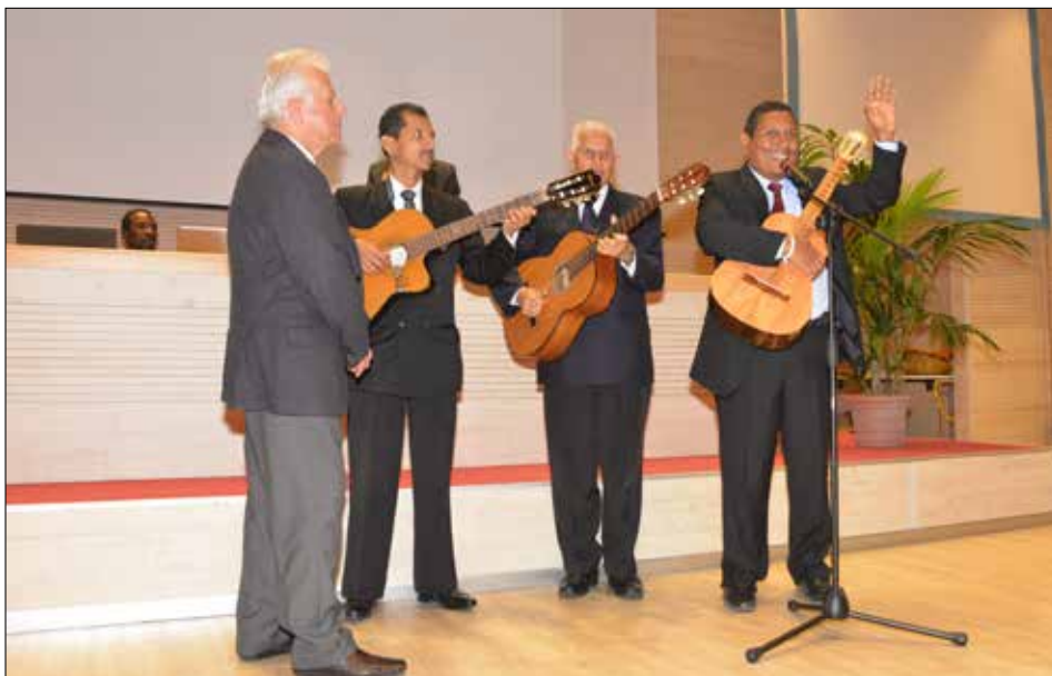
These Latin American brethren were happy to share their music.

Our work is to finish the work that God has given us to do, and every person will receive a reward according to his or her labor. “And, behold, I come quickly; and My reward is with Me, to give every man according as his work shall be.” Revelation 22:12.