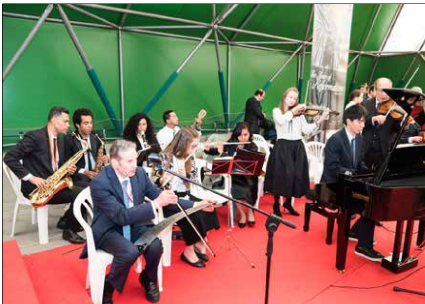
The International Orchestra's beautiful music and accompaniment were a great blessing!

For the conscience to be purified, the Holy Spirit needs to be active in it every day.