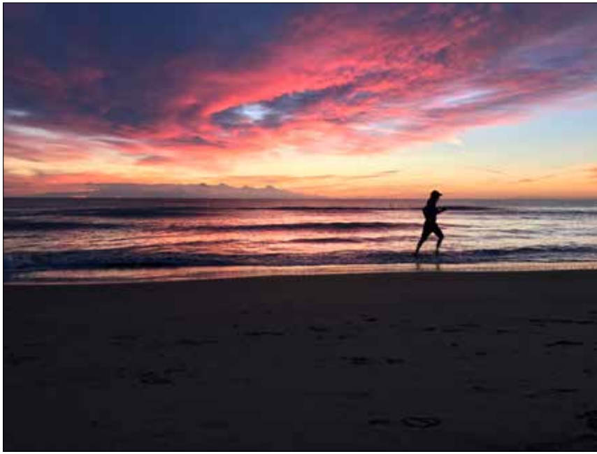
Running on the beach in the morning. Ramiro Ruelas, from Mexico, offered exercise classes from 6:15 to 6:45 every morning.

Both Huss and Jerome prepared for their death as if going to a marriage feast, singing and praising God.