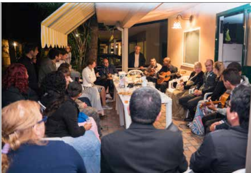
There were opportunities for fellowship during the World Assembly.

God has placed signs showing the right way to go, and the promise is that rest will be the result.