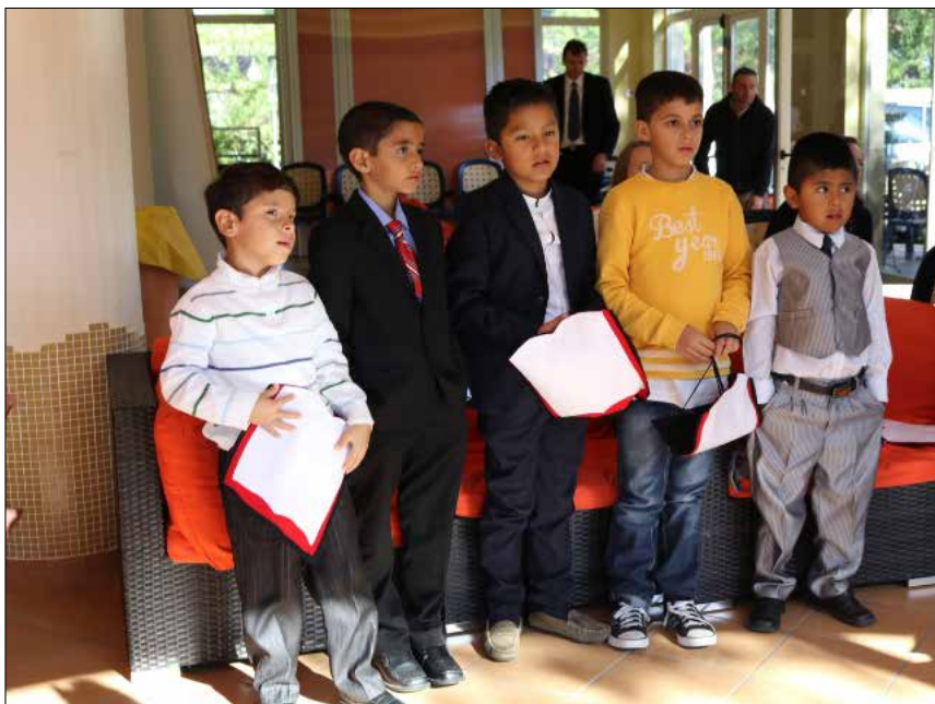
These five boys participated in the children's Sabbath school class.