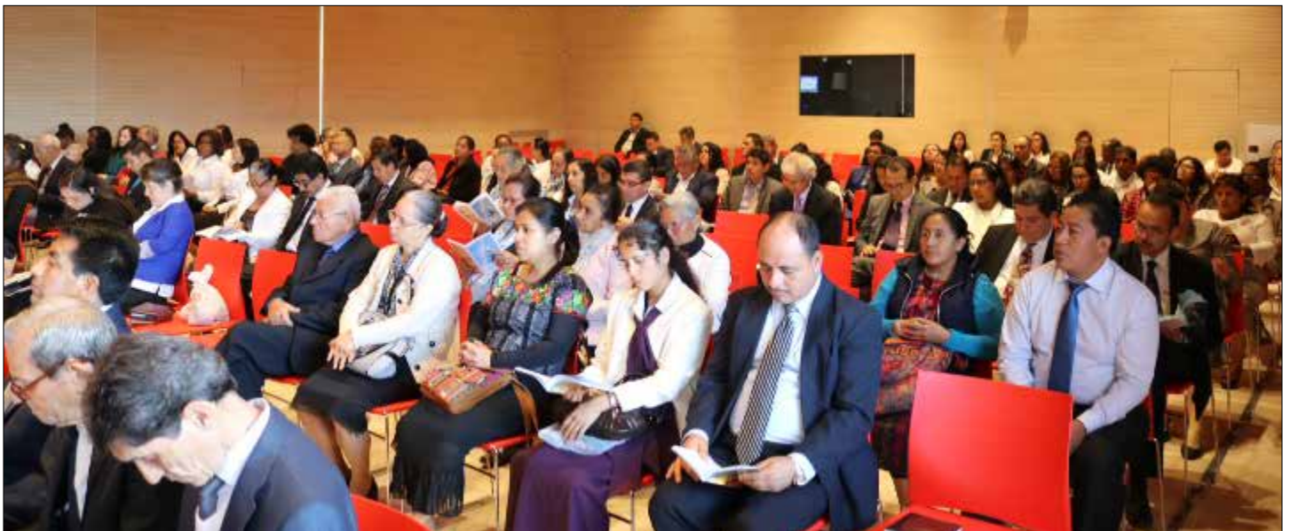
During the Public Conference, participants could sometimes choose between two concurrent sessions, such as this one.

We solicit your prayers and gifts for the advancement of the heavenly kingdom!