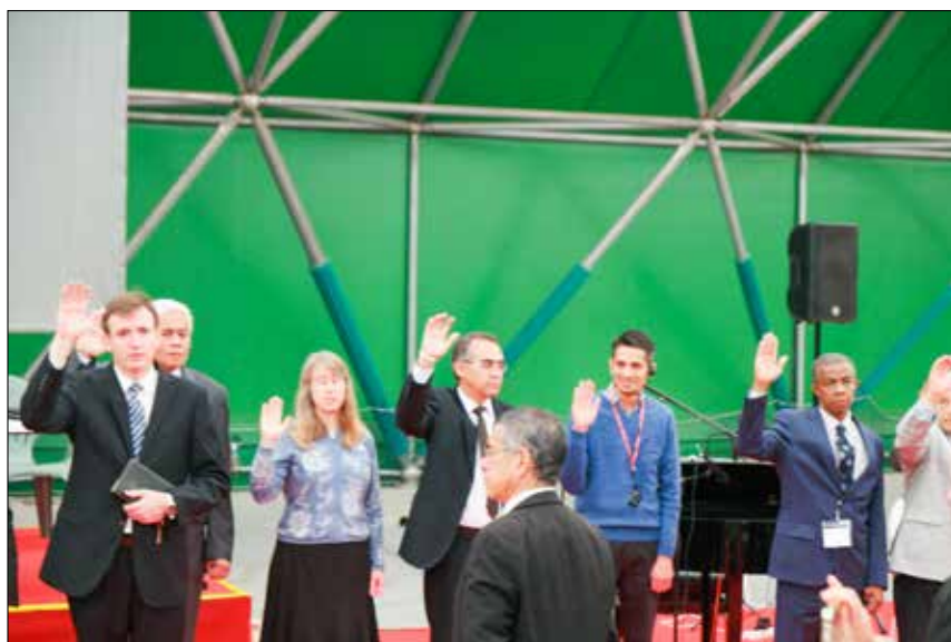
The incoming officers vowed to uphold the Scriptural foundation of God's church.

Jesus' promise in Revelation 22:20—"Surely I come quickly"—sustained the thousands of people who gave up their lives to defend the Bible as the sole source of truth.