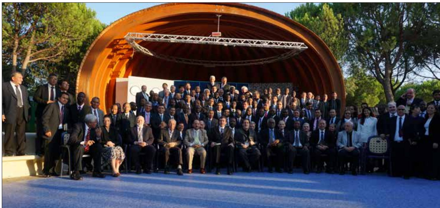
Delegates and staff gathered for this picture in the amphitheater across from the Meeting Hall.

The delegates went on a one-day excursion to Rome, where they had the opportunity to visit important sites, including the Colosseum, where Christians died for