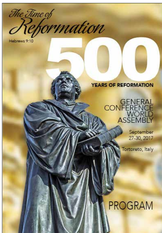
General Conference World Assembly Public Conference Program.

God will multiply every loving effort. When Jesus blessed the 5,000 men besides women and children with food, what did He ask for? He requested everything that the little boy had, and it was enough for the whole multitude. When we give all that we have, God's blessings will follow. Think of the Bible as His love letter to each person. Eternal life is offered and waiting. With faith we can move mountains, and nothing is impossible with God. Let everyone give up everything he has and reap everlasting life.