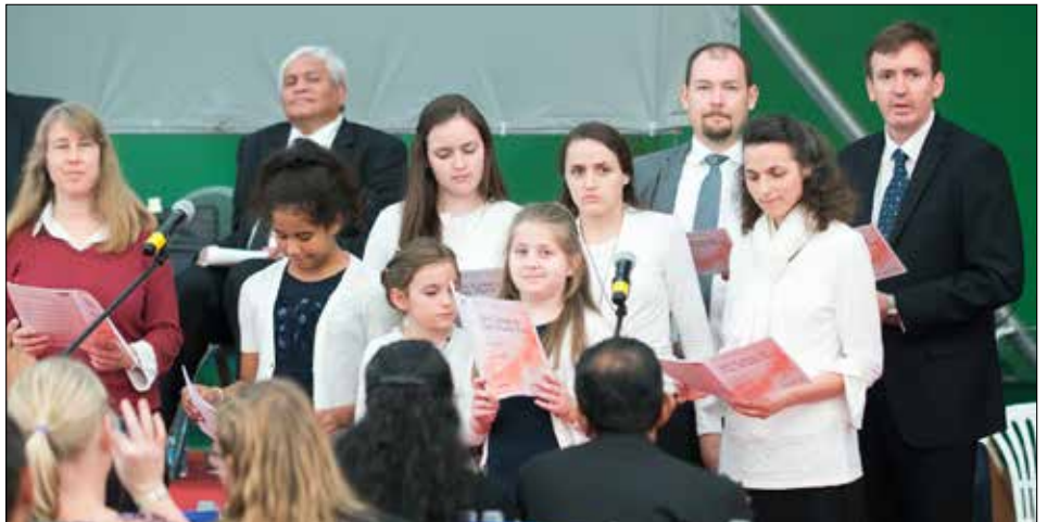
Some of the instructors and students from Cedar Christian School presented a choir piece.

It is by the grace of God alone that so much was accomplished by so few people. May His blessing be upon each one!