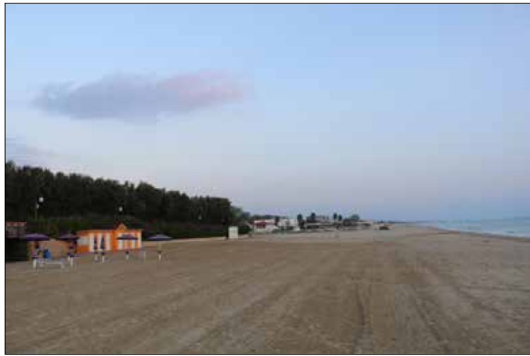
The beach on the east side of Salinello Camping Village.