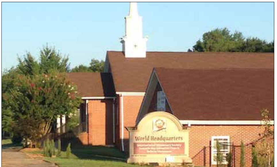
The General Conference headquarters houses the chapel, offices, conference room, multipurpose room with kitchen, sleeping quarters, Cedar Christian School, and gymnasium.