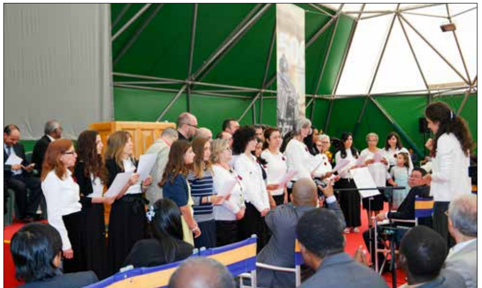
The Italian Field choir presented special music on Sabbath for the public meetings.

The opportunity for the General Conference World Assembly to be hosted in Tortoreto, Italy, in the European Division, is a dream come true. There has been great enthusiasm over this event, and it is with great pleasure that I thank all who worked so hard to make it a blessing to so many. May the God of heaven put His blessings on His children everywhere as they seek to uplift and honor His holy name.