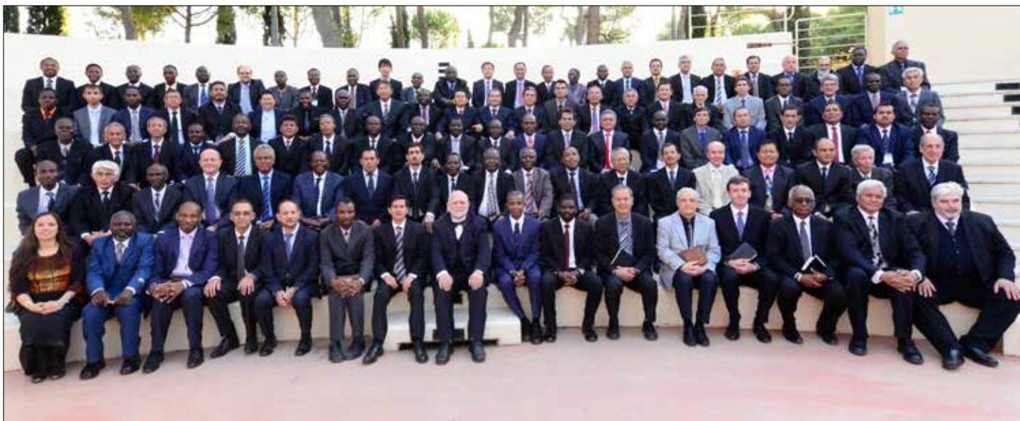
Delegates, outgoing officers, and newly elected officers of the 2017 General Conference World Assembly.