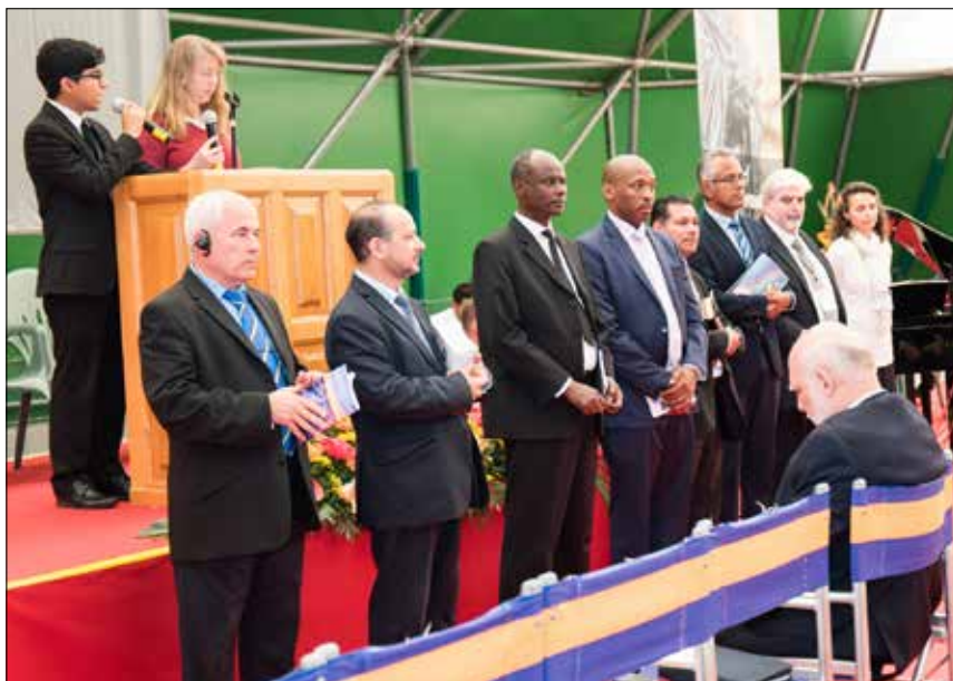
Sabbath school teachers—there were classes for different languages and age groups.

German choir, the Colombian choir, the delegate men's choir, and the International Choir, as well as the International Orchestra. We were blessed beyond measure by them, smaller choirs, ensembles, soloists, and other musicians.