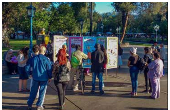
Missionary outreach with posters in Mendoza, Argentina.