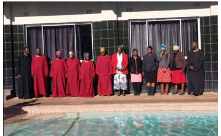
Baptism in Swaziland.

Concerning the house here in Thailand, I have not been able to find a suitable place for our office, my home, and the place of worship. I found many houses but cannot afford the rent because our budget is only US $250. We have a place here that suits our budget, but it is a small house and not large enough for a place of worship and office. I did not proceed with renting this