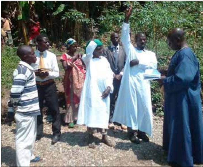
These two souls signaled their commitment to the heavenly kingdom before they were baptized at Kivu Lake in Nyabibwe, Congo.

2015. A number of difficulties were encountered in the past, but now the work is going forward. In addition to meeting with some leaders of the Field, the brethren did missionary work from house to house and conducted Bible studies. Two souls were baptized, followed by the Lord's Supper.