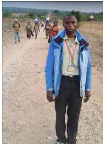
During the bus trip, the passengers sometimes had to walk.

The brother visited churches, different churches came together for seminars, baptisms