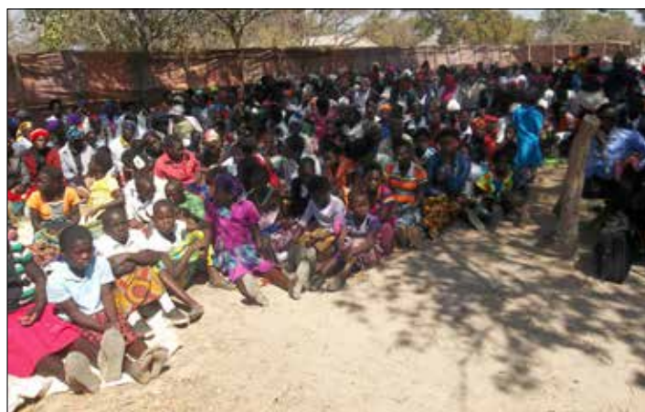
Participants at the Kalomo Field Conference, Zambia.