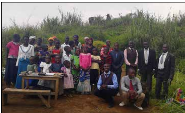
Sabbath services and a seminar on Sunday were a blessing for the members and visitors in Katoyi, Congo.

The next stop was Nyabibwe, where the work was started in