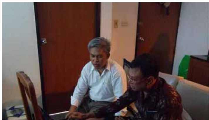
Studying with an interested minister in Thailand.

very disappointed with the SDA Church here, because they are not following the third angel's message. He asked me why the Lord hid from him the truth about the Reform Movement for forty years. He is my guide now, helping me meet people he knows, especially those who are sick. He is very happy when I visit with him, for the Lord answered the longing of his heart. He is willing to work and help develop God's church here. He also wants to look for a place of worship, because if he decides to join us openly, his former church will be against him.