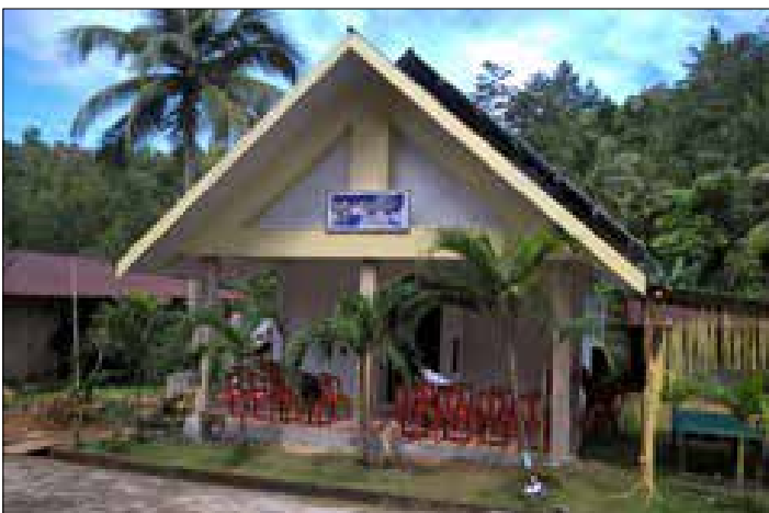
This chapel was dedicated in Pananaru, Indonesia.