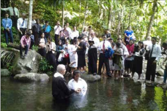
Baptism in Indonesia.

In another place is a Chaudhary community. These people were slaves until just a few years ago. Some of them are still working as slaves, and they want to get out of this situation. There are a few people from one of these communities, and I am talking with their leader. One man with his family was baptized by the Seventh-day Adventists when I was SDA. He is very interested in the Reform Movement. I spent two days there. When I talked about how Jesus gave freedom to people who had problems, some of them believed in Jesus, and they want to have more studies about the Bible. They asked me to stay longer, but I could not because of my financial situation. About ten people are getting ready for