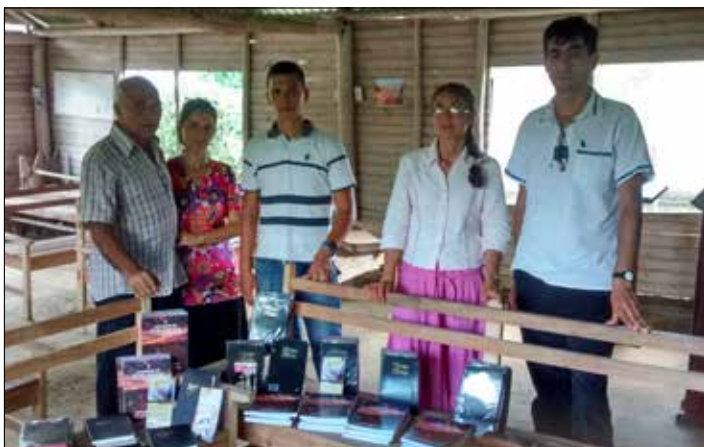
Believers in one of the chapels in Cuba..

We have a new interested soul, and hopefully by the grace of God he will become a member. He is helping us to reach the people. Let's pray for this former Seventh-day Adventist pastor. He is a vegan and a promoter of the Reformation message. He is