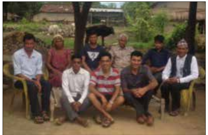
Interested people of the Chaudhary community, Nepal.

Contacts and addresses were received for seventeen Bible studies. In addition, there are others who want to go directly