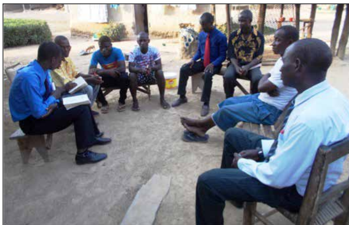
The brethren went door to door in Liberia and conducted Bible studies