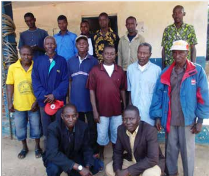
The Liberian field officers met with the town authorities to apply for land for the church