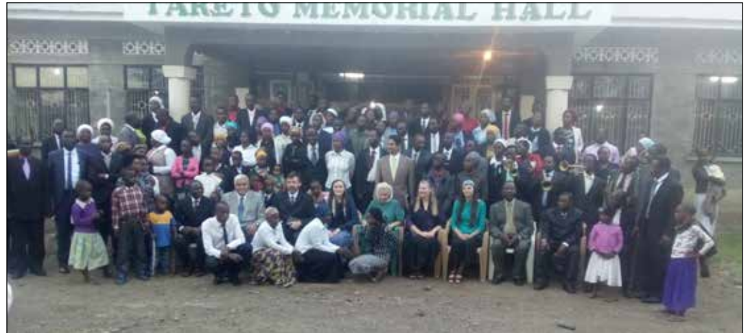
Visitors from twelve countries attended the youth conference in Tanzania