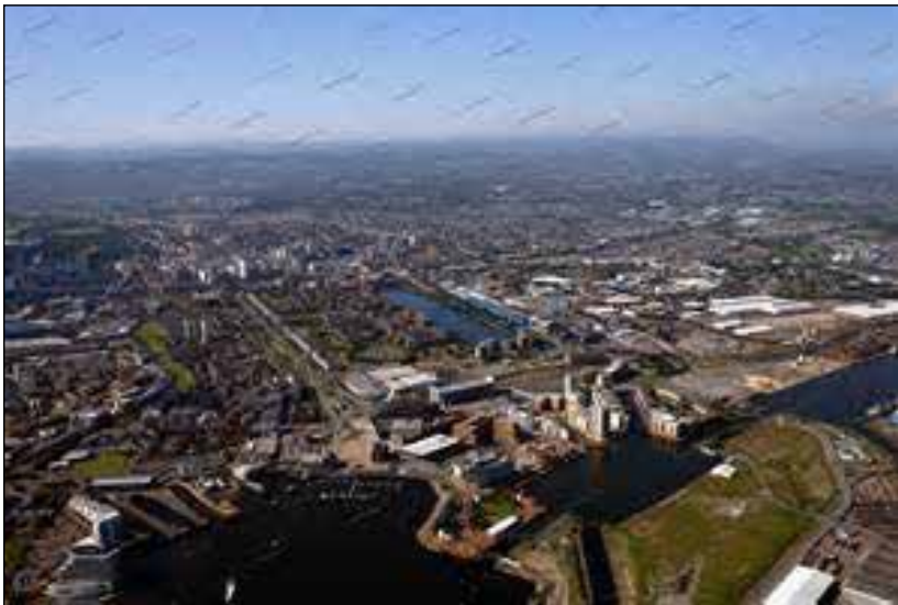
Cardiff is the capital and largest city in Wales. It is the tenth largest city in the UK.

I was able to see how much the influence of the Spirit of God, in answer to my prayer, is able to do amongst even the judges on the bench.