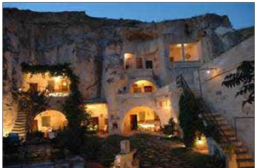
Cave hotel in Cappadocia, Turkey