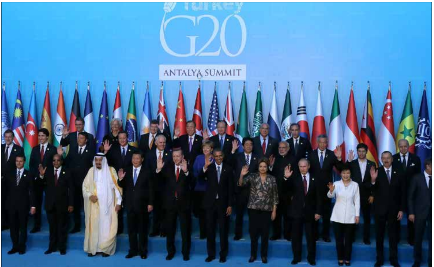
G20 world leaders met in Antalya, Turkey, November 15, 16, 2015

The United States has not only become, but intends to remain, one of the powers of the East.