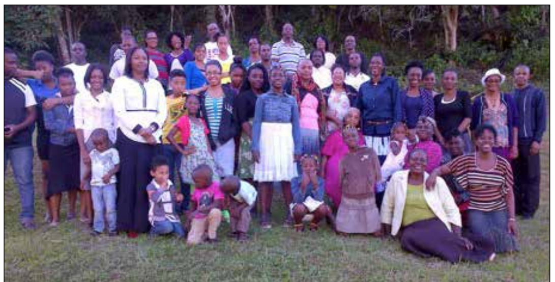
Attendees at the conference in Jamaica, December 23-27, 2015