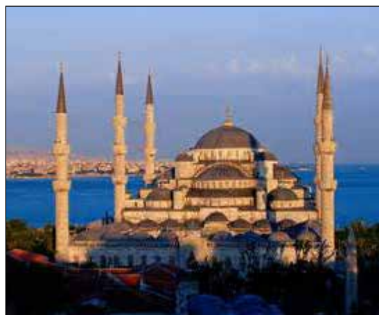
Blue Mosque in Istanbul, Turkey. Islam is strong in Turkey, with 75 million adherents. There are 100,000 Christians.

Thus we have found the origin, the place, the present situation, the work, and the destiny of the great nations of today, which indeed include all the nations of today, for the great nations of today are “the kings of the earth and the whole world.” Their origin is found through the knowledge of the first five of the Seven Trumpets; their place is the whole world; their present situation is the interminable entanglement of the Eastern Question, as it now embraces China; and, with China as their immediate center, and with Turkey as their original and ultimate center, their work is the arraying of themselves, and the mustering of their forces, in preparation for “the battle of that great day of God Almighty;” and their destiny is Armageddon. SW