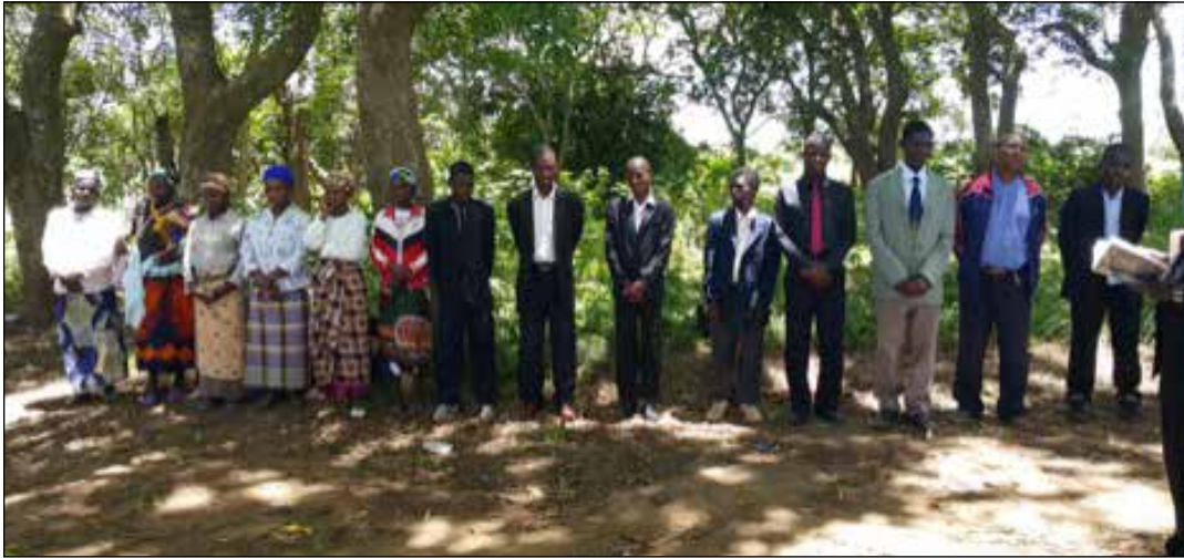
God's work in Mozambique has been blessed with these new brothers and sisters.

missionary work. We thank you for your prayers for Mozambique.