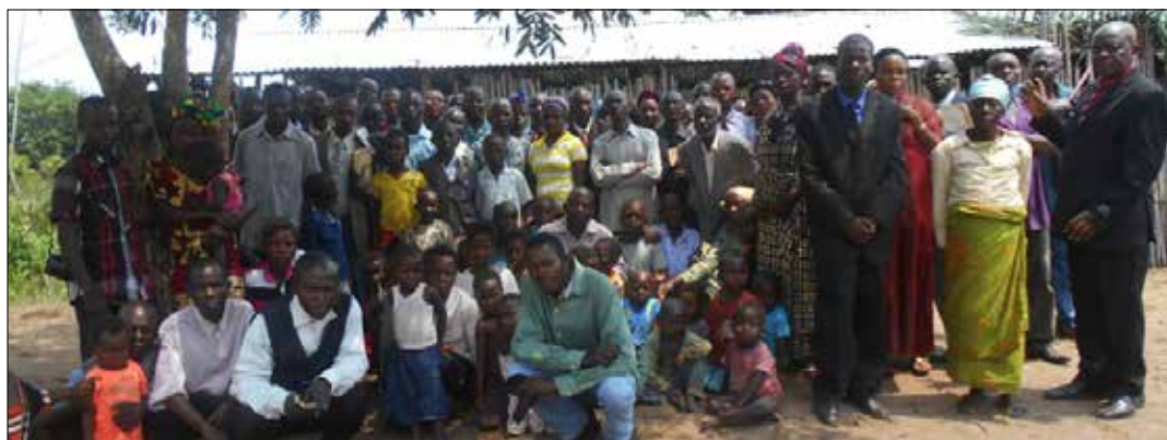
Group in Bapombo, Congo