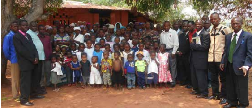
A nice group at a camp meeting in Chikapa, Congo