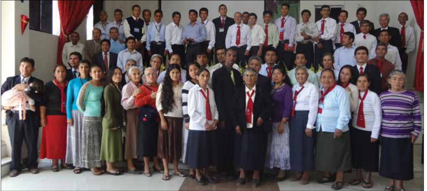
Participants in the combined workers and lay workers' seminar in Lima, Peru

crusade more than 80 people were interested in the message in this one area alone. We baptized 13 souls just in Lusaka.