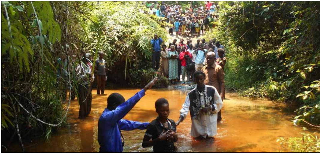
Many people attended the baptism of seven souls in Bapombo, Congo