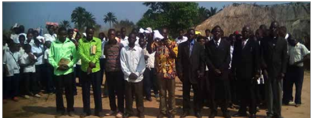
School officials at Dunga Secondary School in the Kasai Central Field, Congo

We also set up a plan for medical missionary work every Sunday in Nyamata, which allows us to help the sick by giving them simple herbal treat-