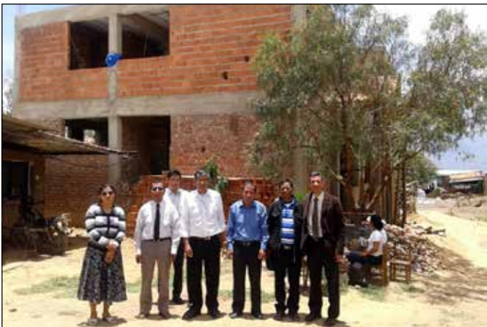
The headquarters building in Bolivia is nearing completion

NORWAY. These funds are available to be used for projects to open the work in Norway. It is anticipated that the European Division will soon provide direction concerning how these funds can best be put to work in this Scandinavian country.