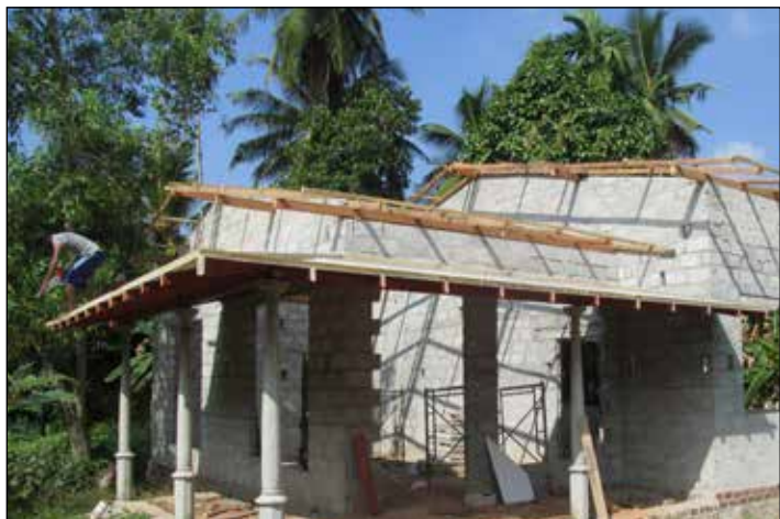
Headquarters building under construction in Sri Lanka

ASIA MISSIONARY SCHOOL. The funds from this Special Sabbath School Offering will be disbursed to the Philippine Union to establish a missionary school