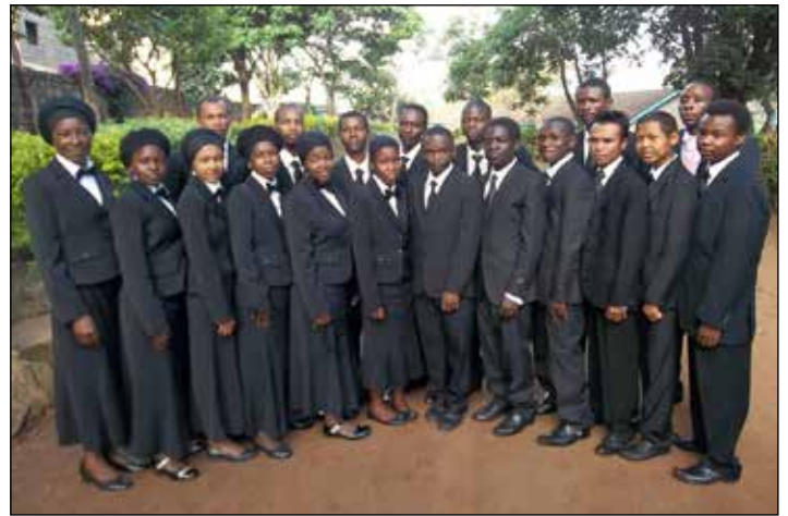
BAMI graduates, November 23, 2014, Nairobi, Kenya

PAKISTAN. Funds have been disbursed for the purchase of a headquarters property, but only half of the price was paid; additional means will be needed to