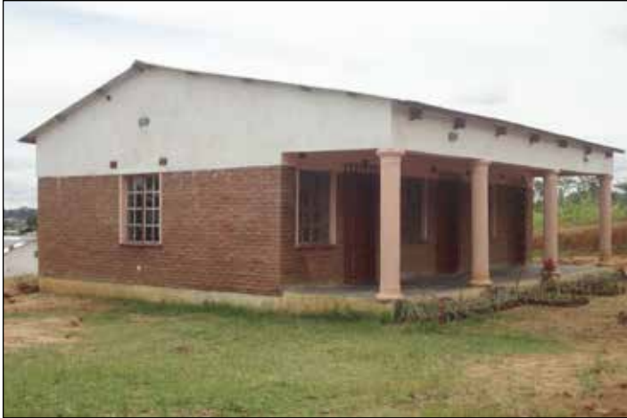
Church constructed in Malawi with Special Sabbath School Offering funds

In some cases, the field or union leaders will ask the General Conference to credit the funds directly to their account with the General Conference so no bank transfer is necessary. The treasurer in that country then submits the quarterly reports of tithes and offerings for the General Conference, and the credit in their account is used to make the payment for them. The field or union can then use funds they set aside for the General Conference for their projects.