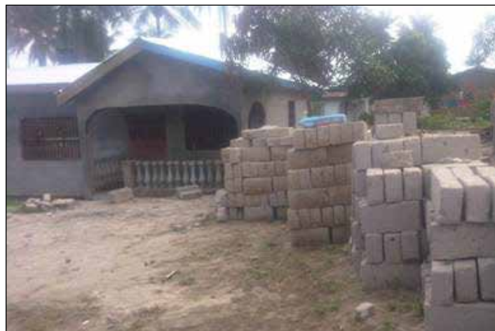
Headquarters building in Sierra Leone purchased with special offerings

We pray that this report will be a blessing and encouragement