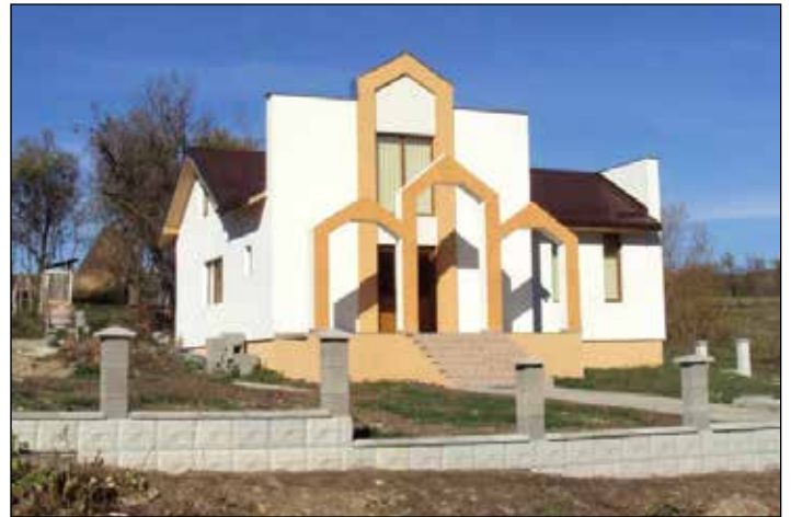
Church built in Cluj, Romania (Bogata de Sus)

ARAB COUNTRIES. Interest in the message of salvation has been awakened in several Arab countries. The funds gathered so far