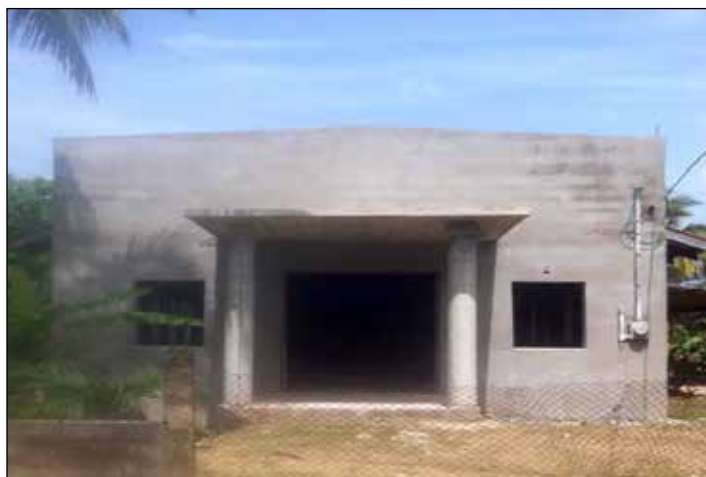
The chapel building in Belize that needs to be completed

SIERRA LEONE. A building for the headquarters and missionary living quarters has already been purchased in Sierra Leone. May