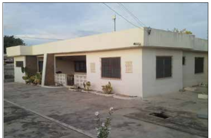
Headquarters and missionary school in Accra, Ghana (West Africa)

are being used for outreach. Members have already been baptized from Iraq and Yemen. Contacts have been made and Bible studies are being held with people in Lebanon, Saudi Arabia, Egypt, and Jordan, as well as with those who were baptized, who are also contacting others.