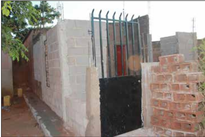
Work continues on the headquarters building in Mozambique

SOUTH PACIFIC ISLANDS. The offering for the South Pacific Islands has been fully disbursed.