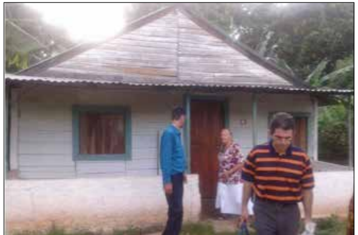
New chapel in Cuba

JAPAN. A small chapel was purchased, and the believers are gathering there for worship.