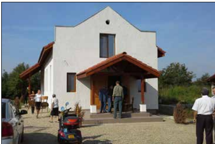
The new church in Costeiu, Romania, dedicated in September 2014

With God's help and blessing, we send all of you our thankfulness and gratitude for the Special Sabbath School Offering that was gathered for Romania on October 6, 2012. We want to give you some details about the work in Romania and how these special funds have been used.