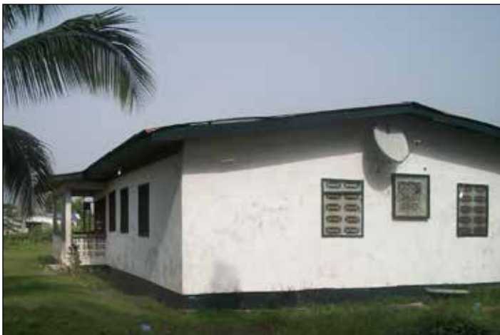
Building in Liberia purchased with Special Sabbath School Offering funds

TOGO. The work is being helped by missionaries from Bethel