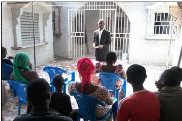
Believers at the headquarters chapel in Banjul, Gambia

the Gilead Adventist Missionary Institute (GAMI).