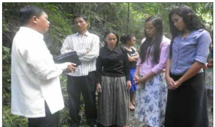
This family was baptized in Mindanao, Philippines