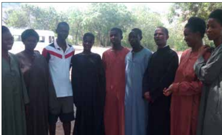
Eight believers were baptized in Ghana in December