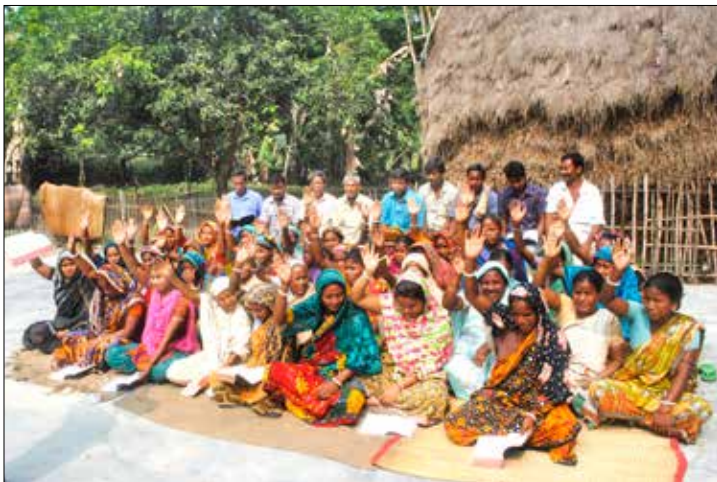
Interested souls in Bangladesh commit to taking baptismal classes