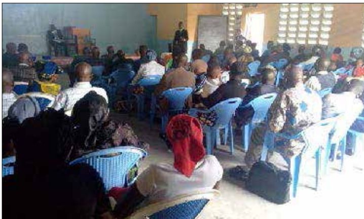
Sabbath service during the Congo Union meetings