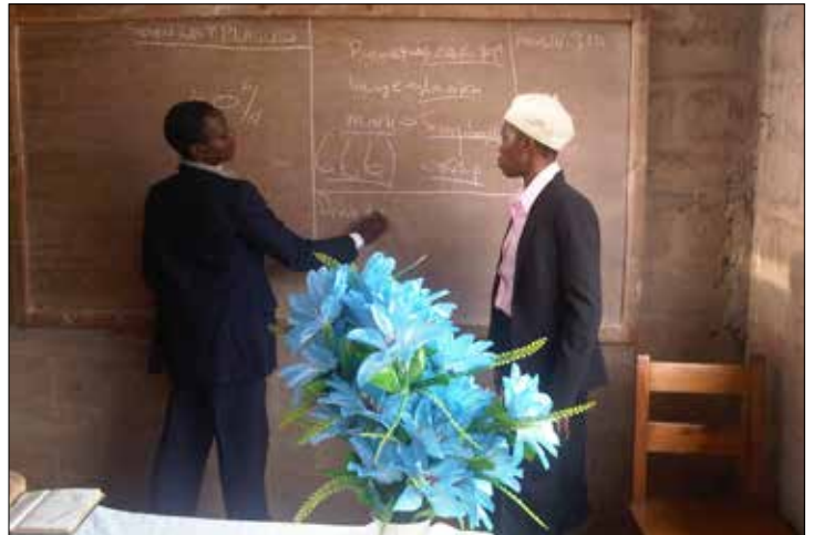
Chalk talks during the seminar in Benin

with our members. During the seminar, most of them had their questions answered. When a call was made on the Sabbath, twelve people decided to take their stand to join the church of God—nine adults, one young man, and two children. They