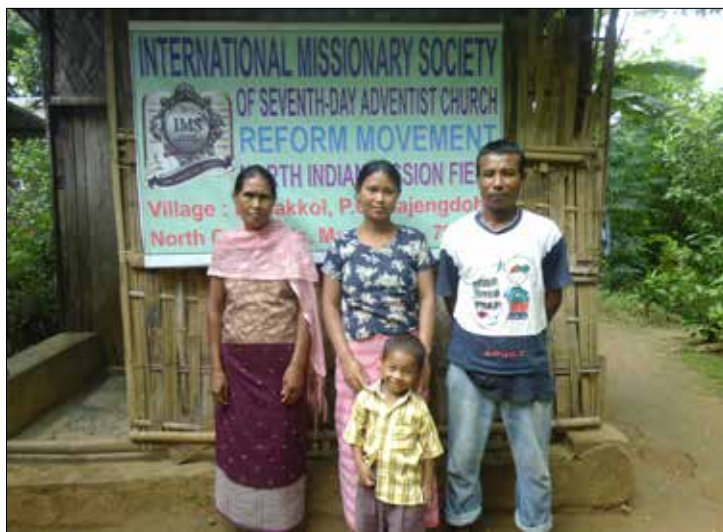
The three adults above were baptized in North India

I presented some very simple things to him about the Reform-mation.