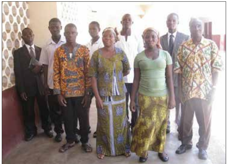
Workers, members, and interested souls in Kumasi, Ghana