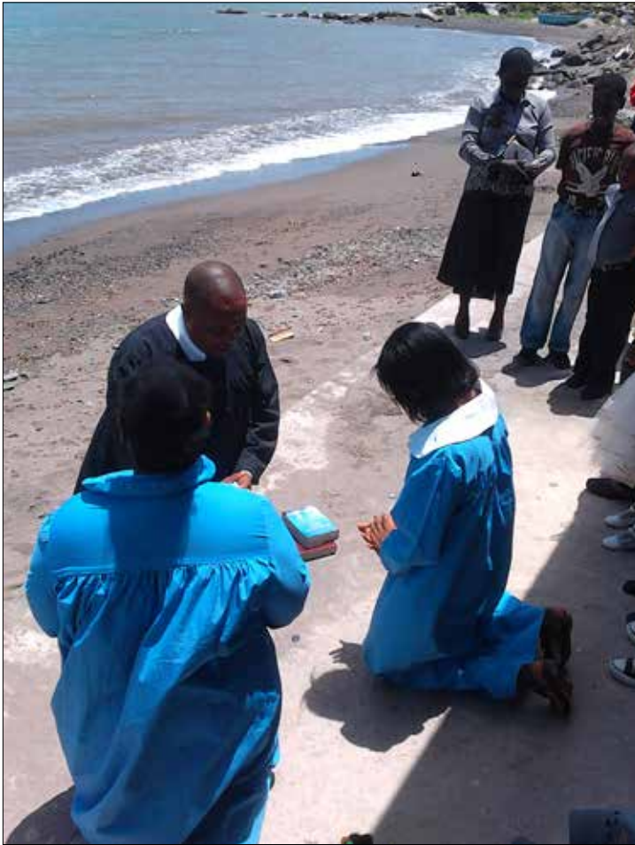
Baptism in Jamaica