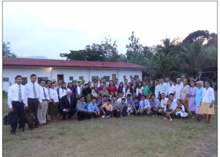
Attendees at the Mindanao Youth Conference in June