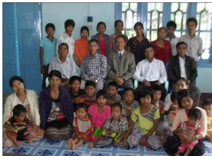
Believers in Matupi, Myanmar

The Lord added three souls to his church. I have attached some pictures of the various activities. The believers look young, but they are of mature age. Please