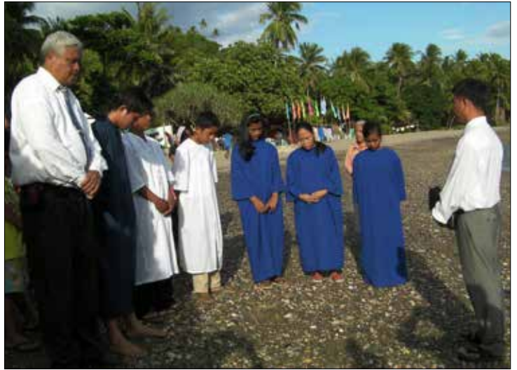
These young people were baptized in Barangay Palje Romblon, Romblon