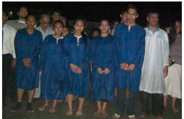
Baptism after the youth conference in Talisay, Cebu, Philippines