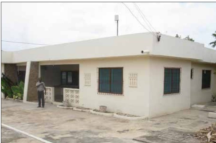
House purchased in Ghana for a missionary school