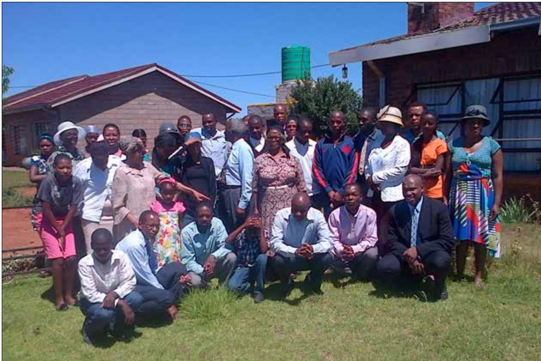
Believers in Lesotho

We traveled there safely, and the Lord protected us. We had some challenges, because it was a mixed group; but we thank the Lord that there is hope that some will be willing to accept the Reformation message. We were asked some questions, such as the meaning of our logo and why we do not conduct the Lord's Supper at night, and so on. Please continue praying for us.