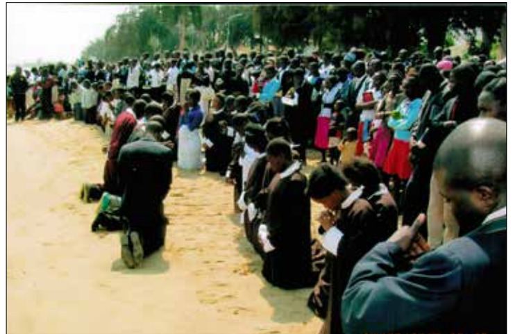
Baptism in Angola