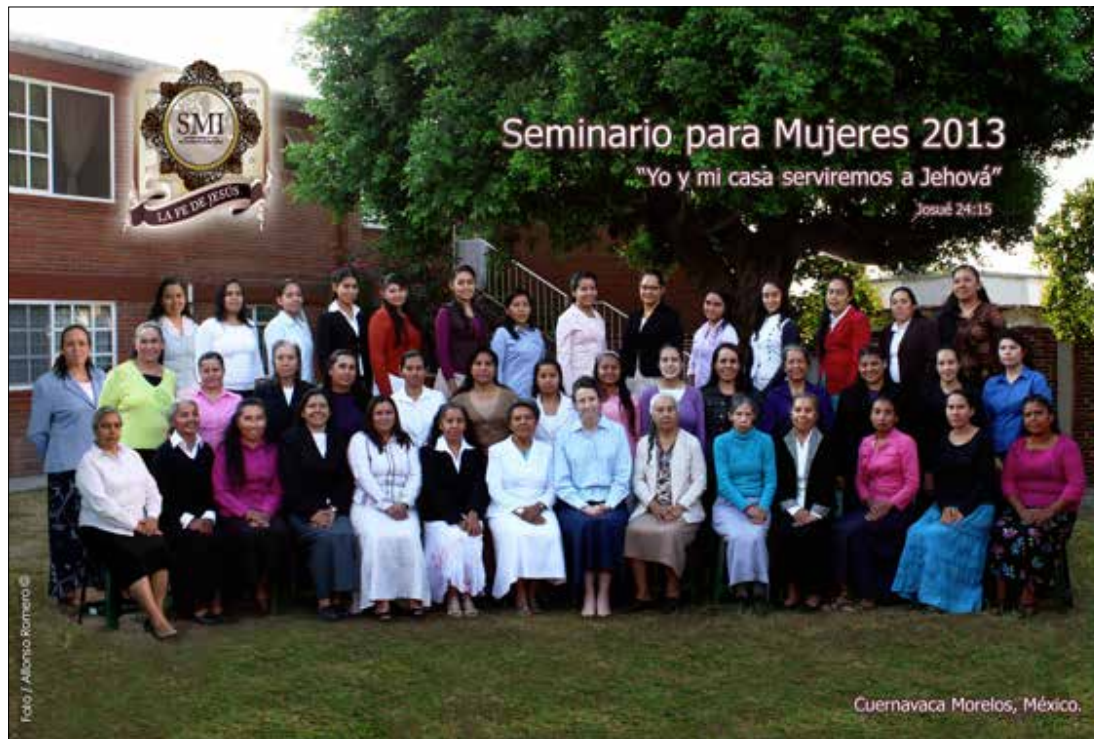
Participants in the Women's Seminar in Mexico

to be involved in their local and regional social and missionary activities, (2) to expand the participation of women in reli-