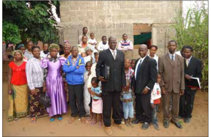
Believers in Mozambique