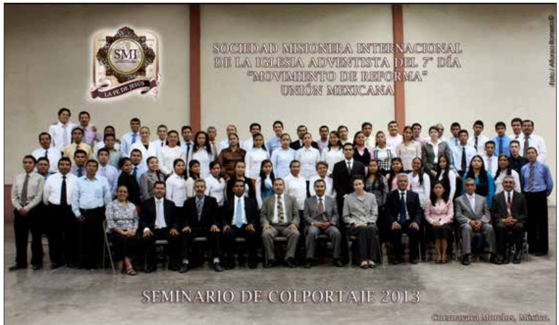
Participants in the Canvassing Seminar in Mexico

The primary purposes of this seminar were: (1) to encourage the pastors' and workers' wives