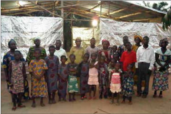
Believers in Benin