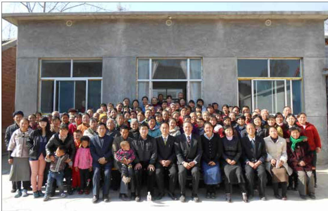
Participants in the health seminar held in China