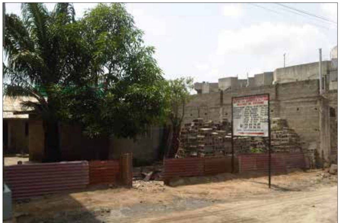
A church being constructed in Benin

Over the last few months, I have been working in evangelism and administrative meetings as well as canvassing, doing a total of twelve presentations each day every time I go out, while maintaining the other areas of work. We held organizational meetings in the district of Lusaka and had a baptism of three souls in a Lusaka hotel. Two of the people baptized are professionals, and one of them holds an important position at Lusaka University