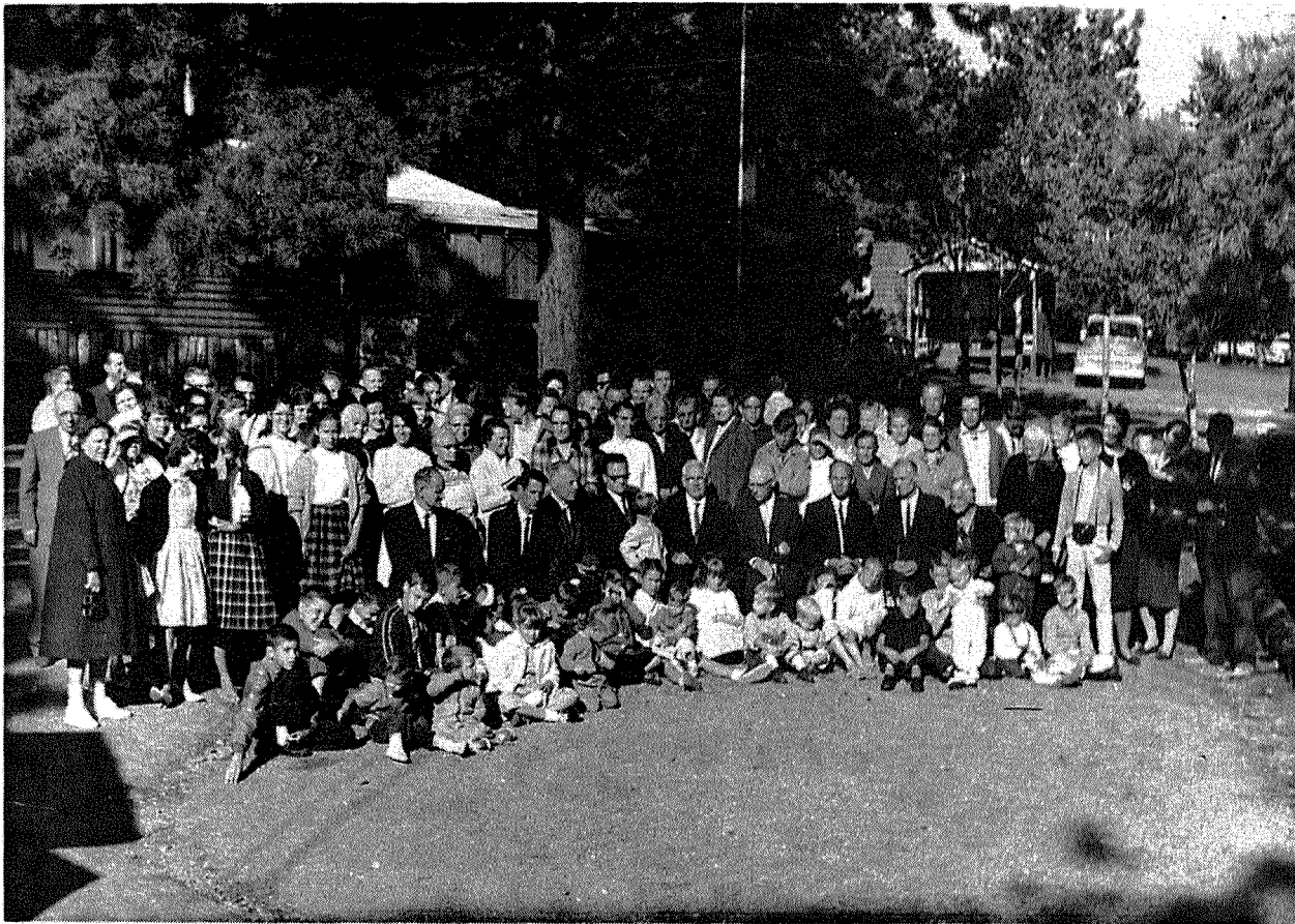
PART OF THE GROUP ASSEMBLED

A NOTHER beautiful Union Conference is now in the past. It was again a reunion of the family of God not soon to be forgotten. We gathered to have fellowship with one another and to exchange the many precious experiences we had made. Even those who traveled many