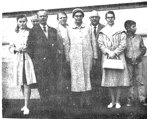
THE SABBATH WATCHMAN

In the meantime, we received a very encouraging letter from our dear sister, telling us her appreciation of our prayers for her, the ship wreck, God's protection (concluded on page 12)