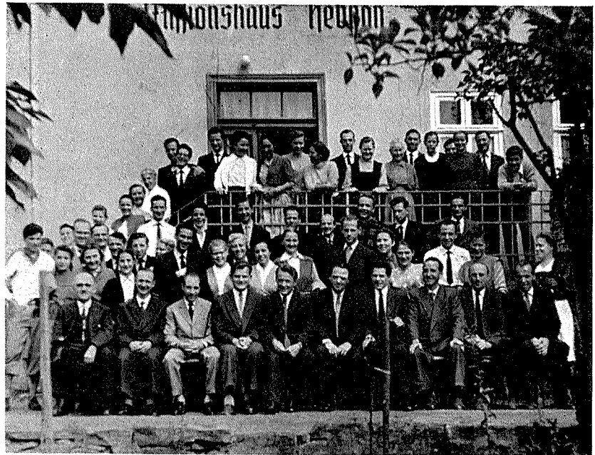
Home Missionary Workers