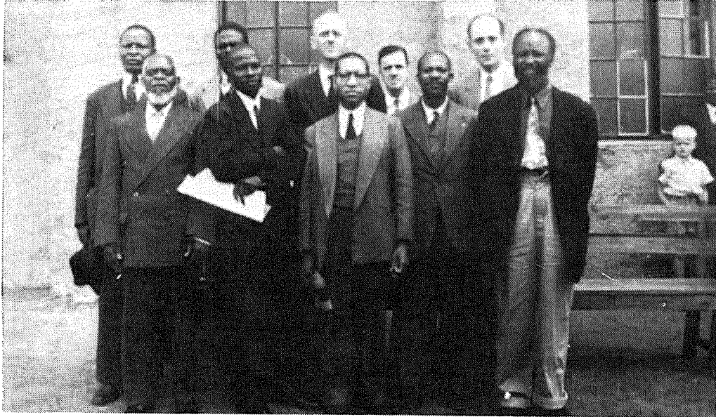
Workers In South Africa

We greet all our brothers and sisters with hearty greetings from Africa!"