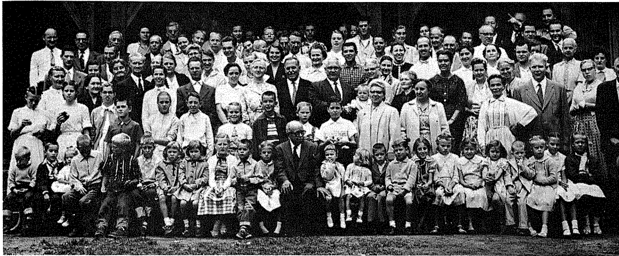
Believers who attended the North American Union Conference.

which went singing on its way, down the slope, and into the adjacent valley. And then, gathering other brooks and streams through the meadows, it would form mighty rivers to feed the wide ocean.