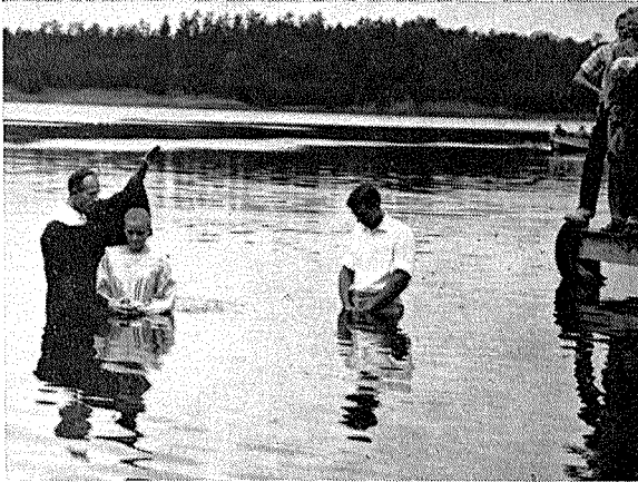
Baptismal scene at the last Union Conference.

elected from the delegates, and the meeting was adjourned by prayer.