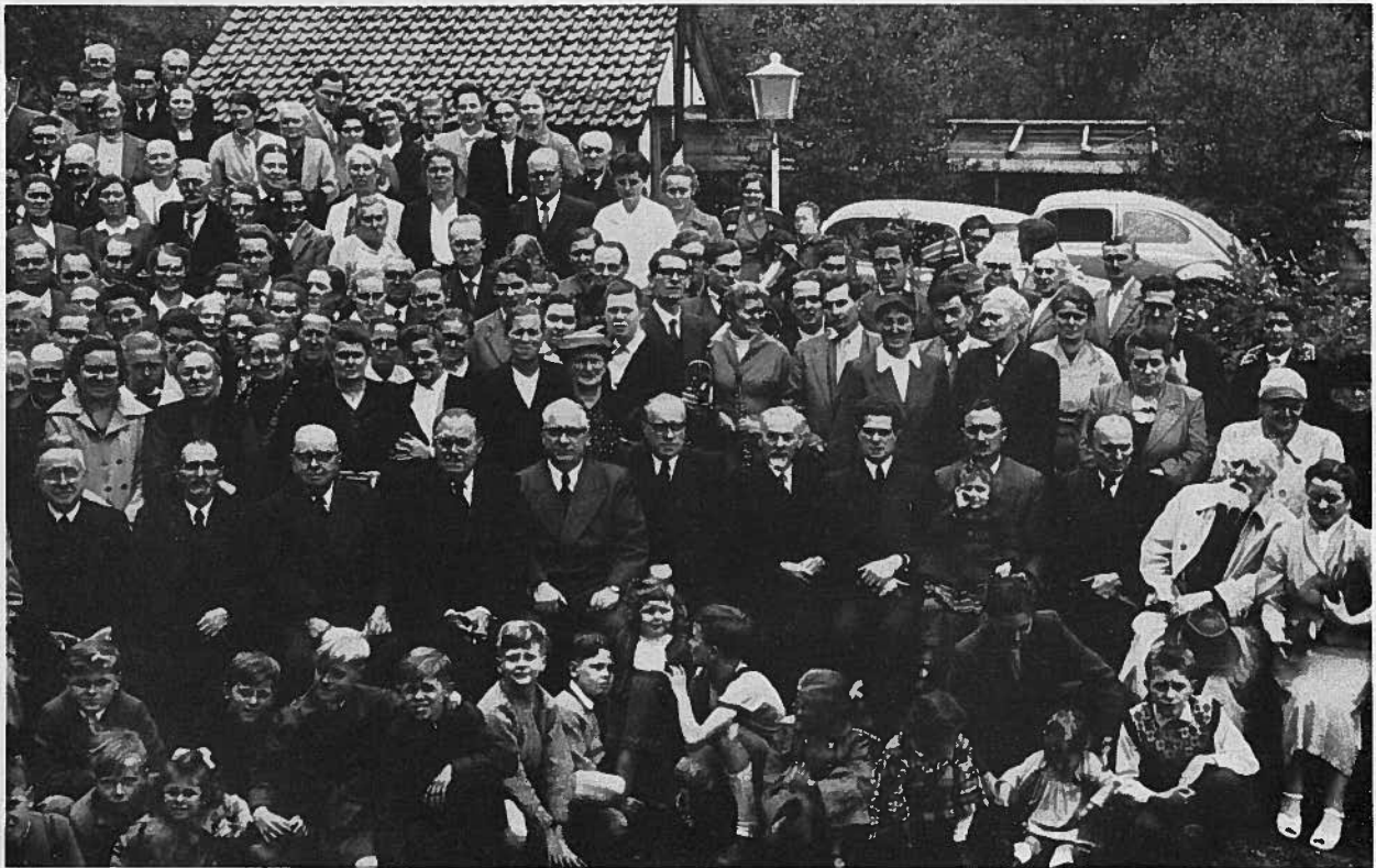
Part of the group who attended the General Conference.