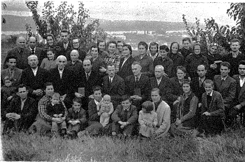
District Conference at Belgrad, Yugoslavia, November 6, 1955.

We have received news from this field, that despite all the severe difficulties our believers have to conquer, the Lord is blessing the work there. The brethren write that they received great blessings while meeting at a District Conference. The Holy Spirit, in a remarkable way, attended the meetings which were held, and plans were laid as to the furtherance of the cause of God. "If God is for us, who can be against us!"