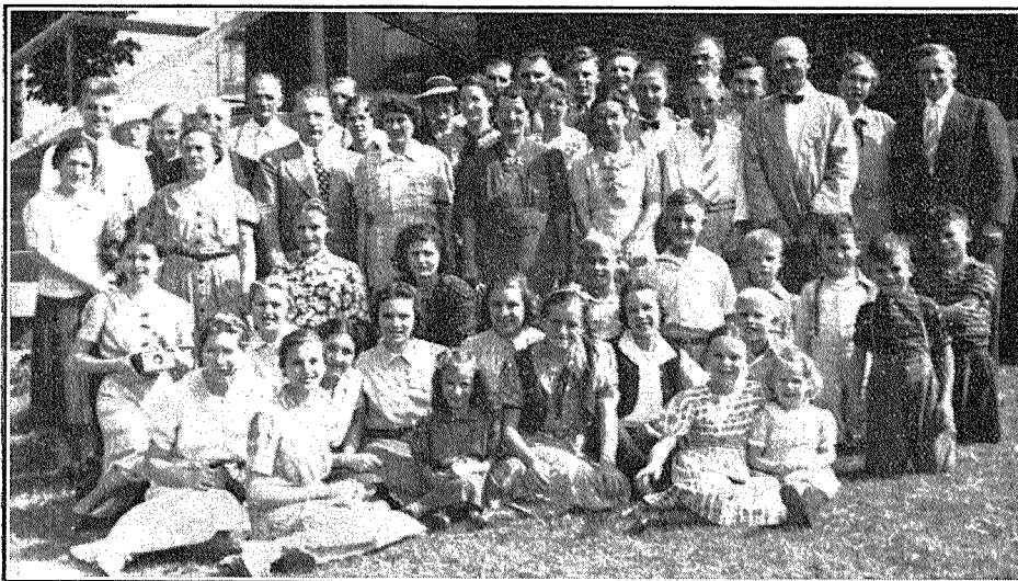
Group of Reformers assembled at Jackson Center, Ohio

Lord's supper. This was our last evening together. It was so hard to break up the meetings for it seemed we all would have liked for them to continue. May God grant that we may have many more meetings where His presence is so closely felt. Our final consolation is that in the earth made new we'll never have to part