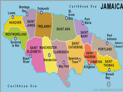
Missionary Report from Jamaica