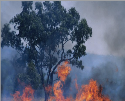
Missionary Report from the GC Disaster Management Fund