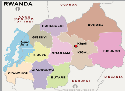
Missionary Report from Rwanda